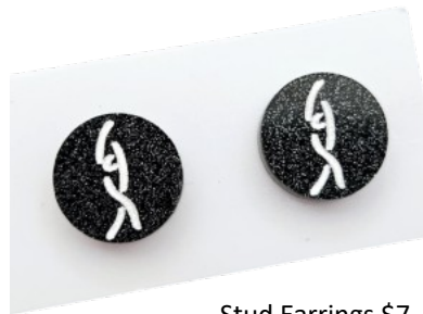
Stud Earrings $7