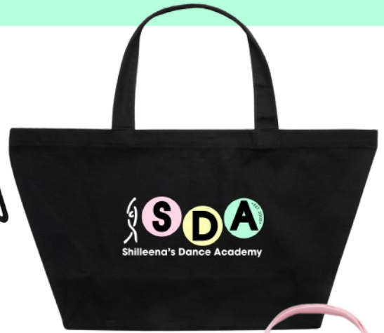
Large Tote $30