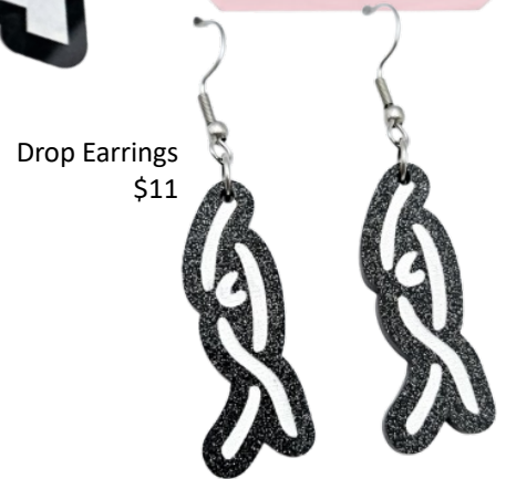
Drop Earrings $11