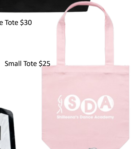
Small Tote $25