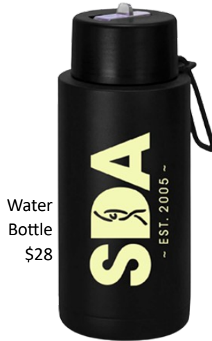
Water Bottle $28