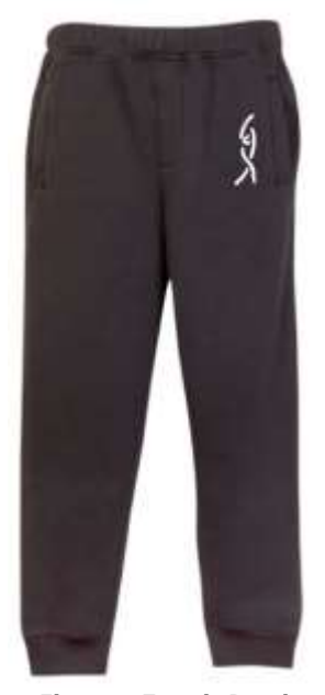
Fleece Track Pants Black Only Child $40 Adult $50