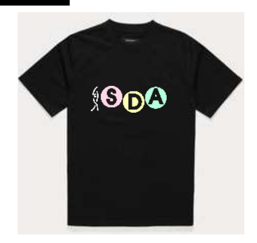
Unisex T-Shirt Child $22 Adult $25