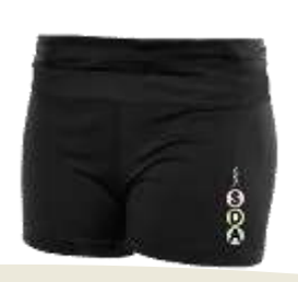
Hot Pants Child $32 Adult $32